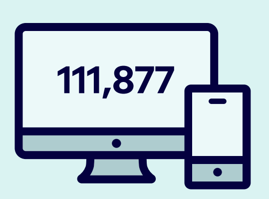
Total website page views